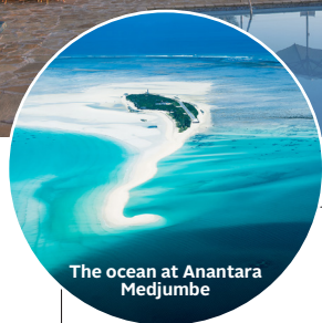
The ocean at Anantara Medjumbe

“ We decide to brave the world's most terrifying swim. ”