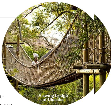
A swing bridge at Ulusaba

Richard Branson's safari property Ulusaba (from $855 per person per night, all-inclusive; virginlimitededition.com/en/ulusaba ) proves the adage that the journey can be as much fun as the destination. This journey involves a twin-engine bush plane gliding over herds of impala, a sun-drenched jeep ride, and a stroll over fairy-tale-worthy swing bridges. The destination? A treehouse suite perched above a dam where hippos and elephants come to bathe. In other words, the best view ever. It's tempting to hole up there (the minibar is stocked with Champagne), but we head out on our first game drive. The Big Five (game animals) are elusive, so we stop at a pretty view and toast the antelope below with a sunset gin and tonic.