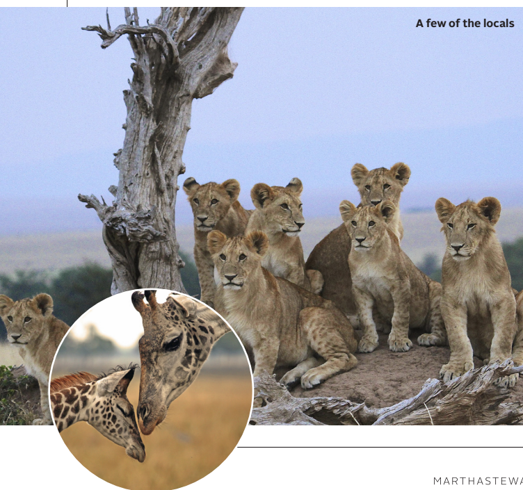
A few of the locals

The best part of visiting South Africa in November? It's still baby-animal season! Knock-kneed giraffes, mischievous monkeys, and naughty lion cubs cavort about, putting on a show as we explore the Sabi Sands Game Reserve. Our jeep speeds across the open plains and into a dense thicket, where we suddenly halt. Two tusks and a massive trunk come into view, curling around a branch and swiftly pulling down an entire tree to reveal a herd of at least 30 elephants. Because these giants see the safari jeeps as one large, peaceful animal, they pay us no mind, sauntering so close that we could (but don't!) reach out and touch them. Our jeep is alone with the herd for nearly an hour, something you're more likely to experience when booking a lodge in one of the private game reserves away from the massive crowds in Kruger National Park. We return to camp for an equally exciting surprise: the impromptu reception of two guests who decided to elope against a backdrop of giraffes and fireflies in the bush. The staff break out the good stuff: bottles of South African pinotage, chenin blanc, and cap classique.