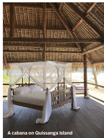
A cabana on Quissanga Island

We stave off the end-of-honeymoon blues by sailing across the turquoise waters for a day on nearby Quissanga Island. We're the only two souls around, curling up on an antique carved daybed beneath a thatched cabana. Anantara's chef pops across at lunch-time, bearing the morning's catch of giant prawns and lobster, which we eat beneath swaying palms on the sand. We've officially mastered relaxation. And it's given us the space to absorb the sheer joy of it all—of finding each other, of our wedding day, of our luck in getting to share this adventure and all of the other adventures to come.