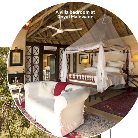
A villa bedroom at Royal Malewane