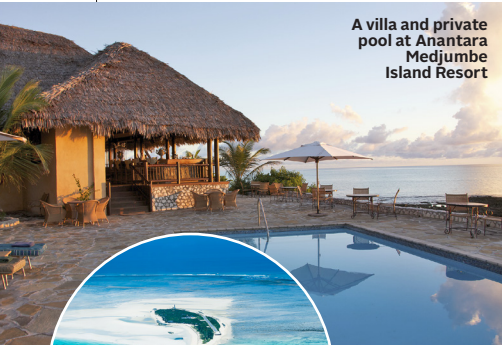
A villa and private pool at Anantara Medjumbe Island Resort