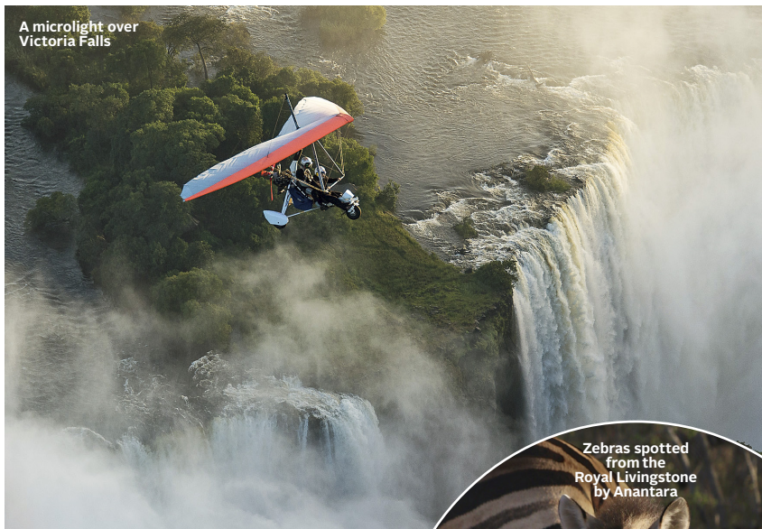
A microlight over Victoria Falls

Things look up when we arrive at the Royal Livingstone Hotel by Anantara (from $500 per night, royal-livingstone.anantara.com ), a stately oasis along Zambia's Zambezi River. We decide to brave the world's most terrifying swim, a pool on the edge of the raging waters of Victoria Falls. A boat speeds us past crocs and hippos, and we plunge into the cool, rushing river, swimming till we reach Devil's Pool, a natural infinity pool at the top of a sheer 355-foot drop. Calm takes over as we settle in and watch rainbows arching in the mist of the falls. We decide to up the stakes that afternoon with a flight on a microlight—basically a giant kite with a motor. Our pilot swoops low across Mosi-oa-Tunya National Park, floats above elephants drinking in the river, and cuts off the engine above the falls. My breath catches as we soar in silence, gliding like a bird over the torrents and rapids. We need a drink or two to quiet the double helping of adrenaline, so we head to the candlelit hotel bar as a singer croons like Louis Armstrong, and zebras meander past in the setting sun.