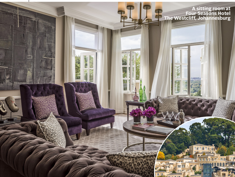
A sitting room at Four Seasons Hotel The Westcliff, Johannesburg