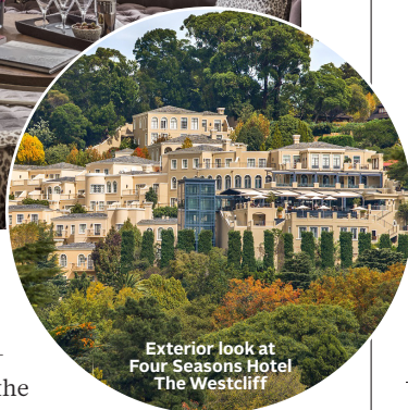
Exterior look at Four Seasons Hotel The Westcliff