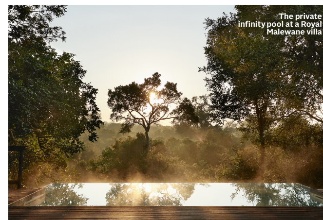
The private infinity pool at a Royal Malewane villa

“ Safaris are actually a delicious exercise in laziness. ”