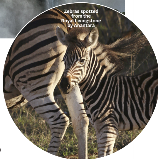
Zebras spotted from the Royal Livingstone by Anantara